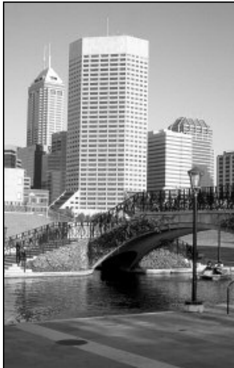
Indianapolis skyline looking from the Central Canal

Call AVIS at (800) 331-1600 or your travel agent. Refer to AWD J097937 . You can book online at www.nacada.ksu.edu/NationalConf/2006/discounts.htm . The AWD number is built-in at that link.