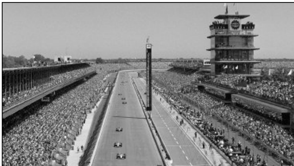
“The Greatest Spectacle in Racing,” the Indianapolis 500, takes place at the famed oval of the Indianapolis Motor Speedway.

When you reserve your hotel room, we ask that you stay in one of the official hotels and reserve it through the official Housing