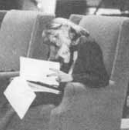
Studying the issues