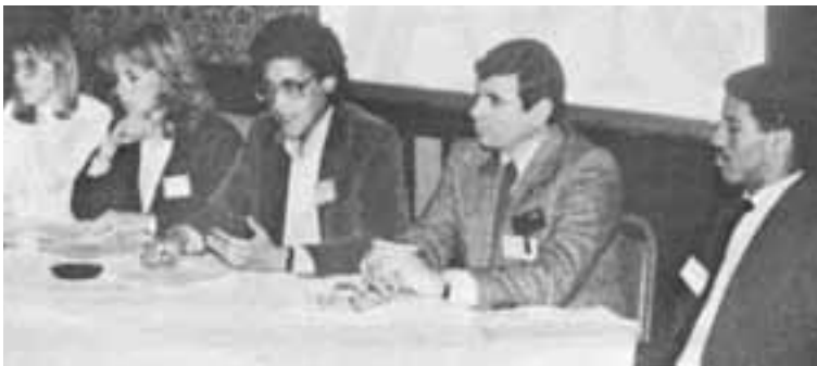
Panel discussion at National Conference