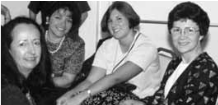
Members of the Multicultural Concerns Commission connect at National Conference