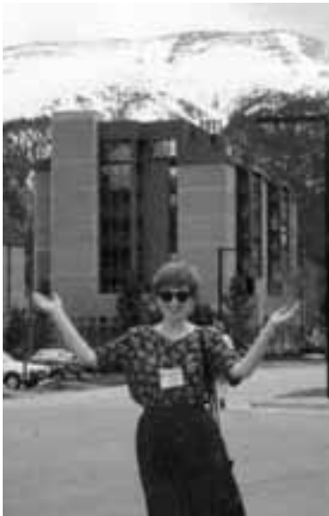
Summer Institute participant enjoys the hospitality of Copper Mountain, Colorado