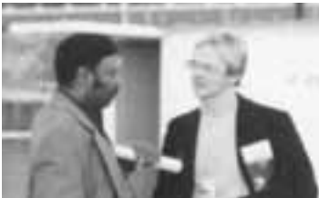
Conference participants enjoy discussion in Memphis