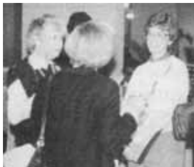
Conference participants discuss a variety of topics.